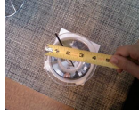
Figure 2: The diameter of the rim is 4in.

5.5cm. Now, reading this is not so easy, because the theoretical point of the cone, where the two sides meet, is well into the stem, and I don't recall if this is my first or second Martini, making things only more difficult. So we've got to finesse things a bit; as they say, this is an engineering problem. Below, we'll see that the bottom bit, the corner that would be liquid in a perfect cone but is glass in the real world, is not a concern.