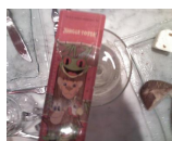
Figure 3: This narrower glass has a rim diameter of only 6.5cm.